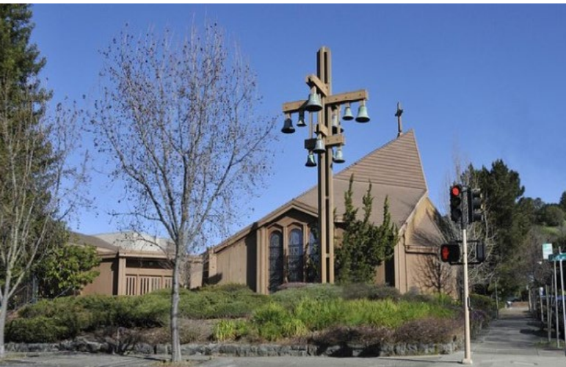
First Presbyterian Church 1510 5th Ave, San Rafael, CA 94901

Conveniently located downtown San Rafael on corner of 5th Ave and E across from the public library and 1 mile from Hwy 101. Easy access to public transportation.